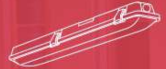
NON CORROSIVE LINEAR